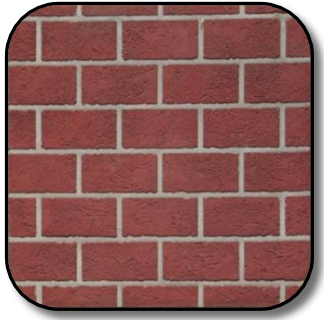
Running Bond (Dark Coral)