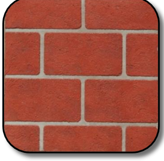
10" Regal (Burnt Red)