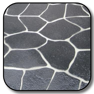
Bush Rock (Charcoal)