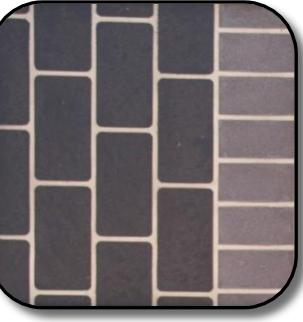
10" Regal & Soldier Course Boarder (Charcoal & Grey)