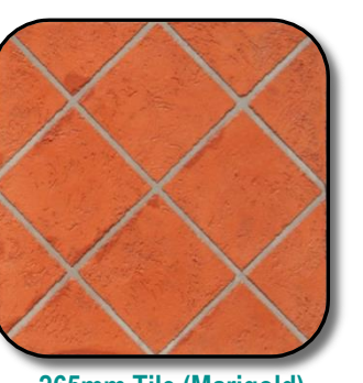
265mm Tile (Marigold)