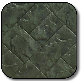
Dark Green – Black (Rel)