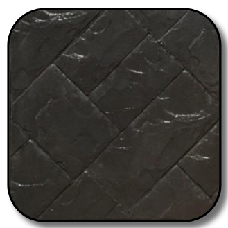
Black / Neutral (Rel)