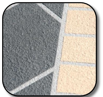
265mm Tile & Soldier Course Boarder (Grey & Off White)