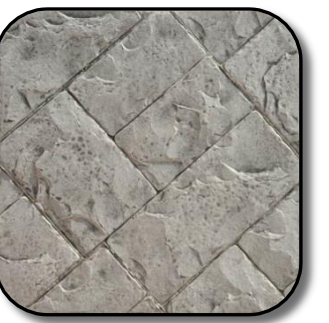
Bluegum – Black (Rel)