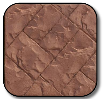
Tan / Choc Brown (Rel)