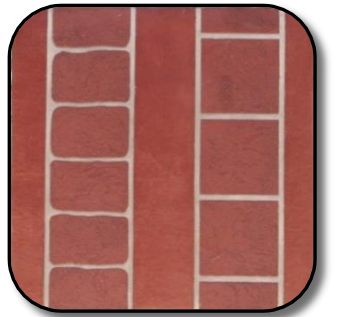
Cobble Brick Edge & Tile Edge