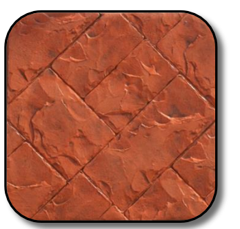
Marigold – Bluestone (Rel)