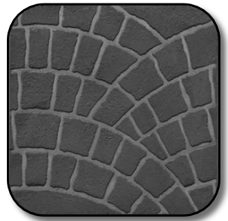
Cobble Fan (Charcoal)