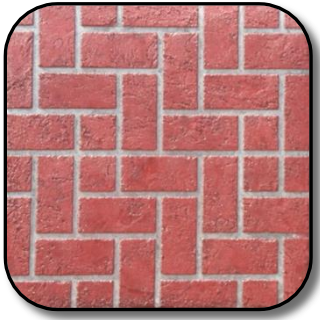
Herringbone (Brick Red)