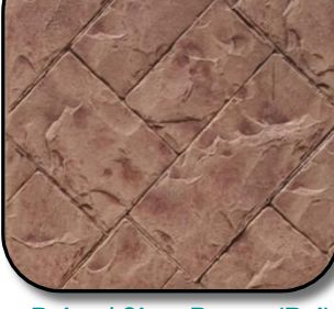
Beige / Choc Brown (Rel)