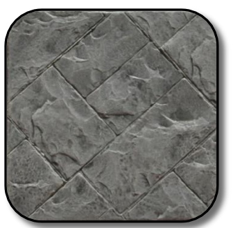
Grey - Black (Rel)