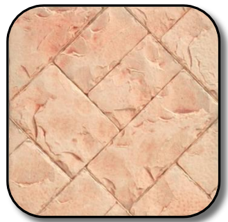
Sandstone – Terracotta (Rel)