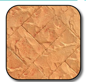
Buff – Terracotta (Rel)