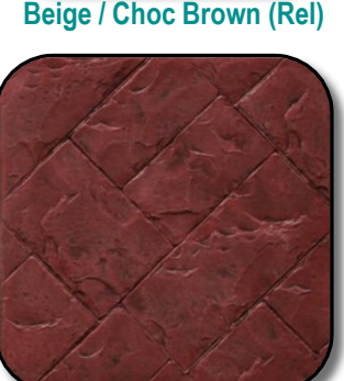
Brick Red / Black (Rel)