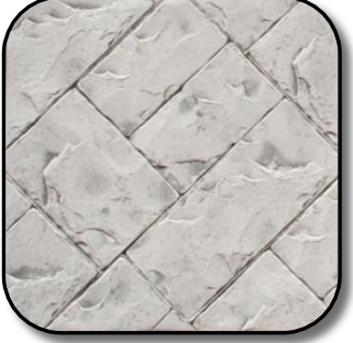
Off White / Bluestone (Rel)