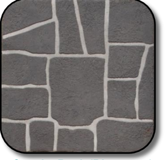
Convict Rock (Bluestone)