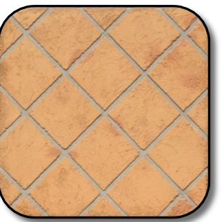
8" Tile (Buff)