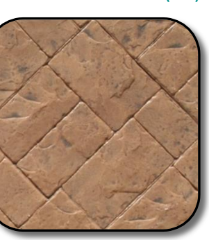
Faun – Bluestone (Rel)