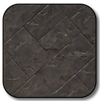
Bluestone / Black (Rel)