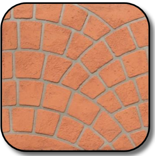
European Fan (Salmon)