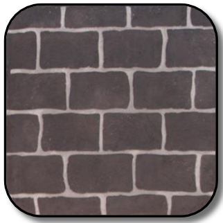
Cobble Brick (Charcoal)