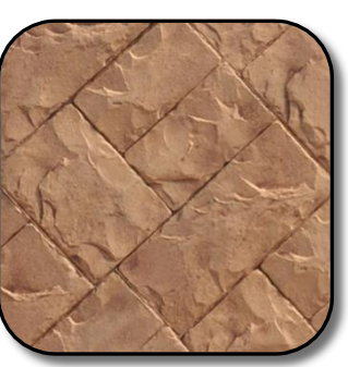
Faun – Choc Brown (Rel)