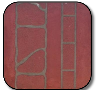
Bush Rock Edge & Brick Edge